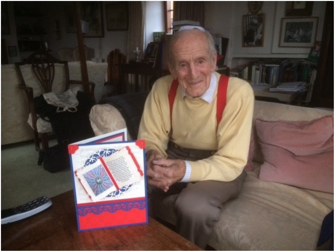
Receiving his birthday card from the YDOA.